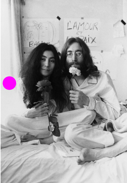
YOKO ONO TRANSMISSION 13 Okt 2017 – 18 Feb 2018