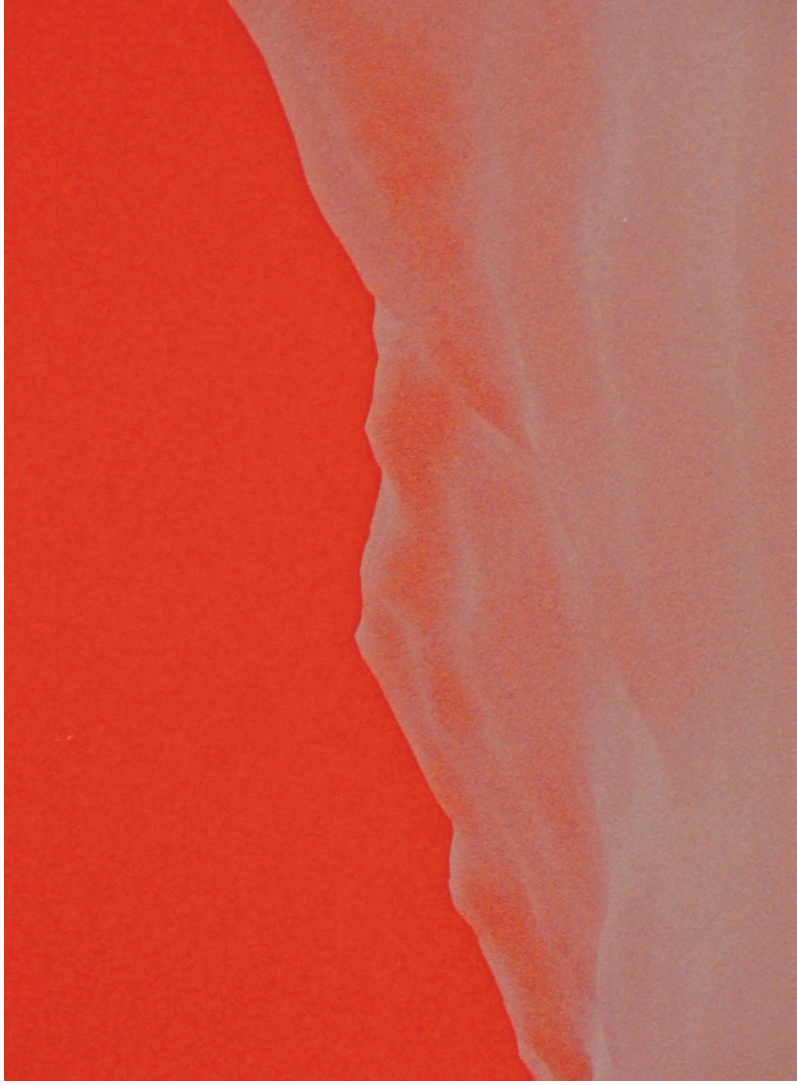
Tine Zenner Arrábida . 16 mm film HD scan, stereo sound, 16 min, 2016-17