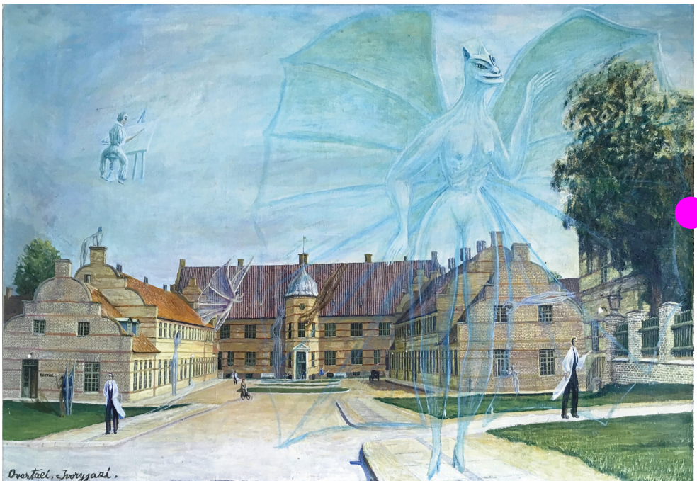
Kunstværk af Ovartaci / Art piece by Ovartaci.