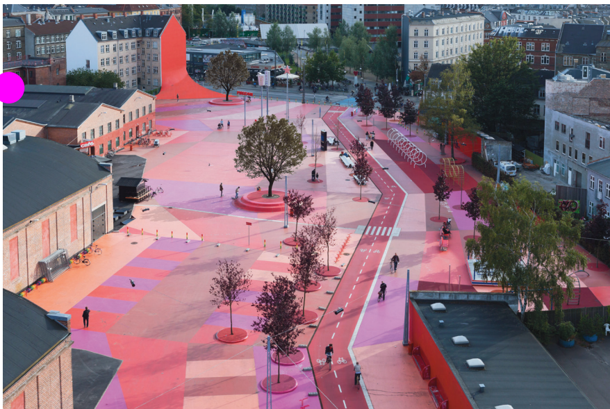
BIG ART, Superkilen Park.