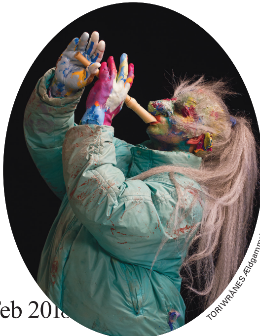
TORIWANES #Eldgammel Baby 16 Sep – 19 Nov 2017